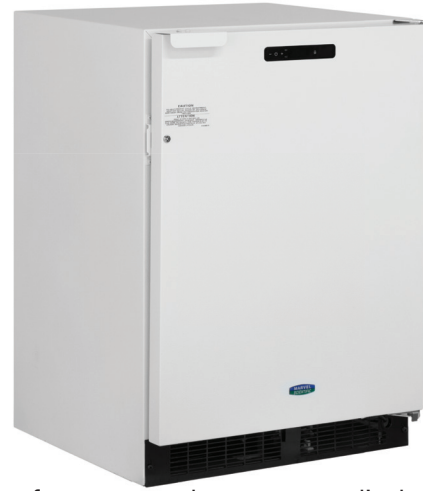
Door-front-mounted temperature display and user interface