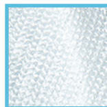
Microdenier ribbed tube