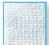
Polyester smooth tube