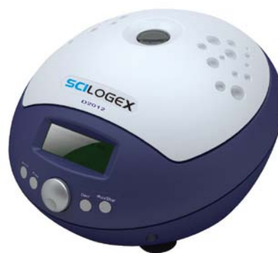
D2012 High Speed Micro Centrifuge