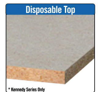
Particle Board Edge Cut