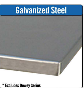
Galvanized Edge Cut