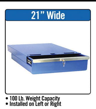
Stainless Steel Upgrades Available As Option