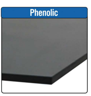
• 3/4" or 1" Edge Cut • 3/4" or 1" Round Edge