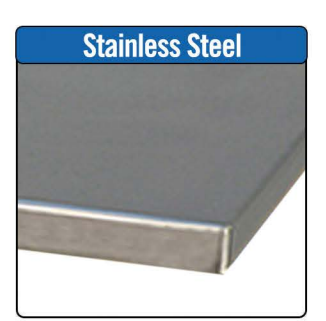
• Grade 304 (Edge Cut or Round Edge) Grade 430 (Edge Cut or Round Edge)

• Edge Cut (Oil or Lacquered) Round Edge (Oil or Lacquered)