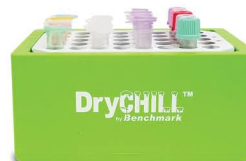
Item: DC4020 40 x 1.5/2.0 ml tubes