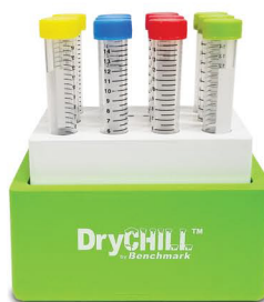
Item: DC1215 12 x 15 ml tubes (16-17mm)