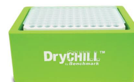
Item: DC9602 96 x 0.2 ml tubes or 1 x PCR plate