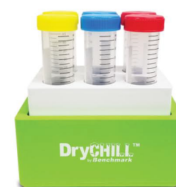
Item: DC0650 6 x 50 ml tubes (29mm)

The DryChill cooling blocks are designed to store samples safely on the lab-bench without sample degradation due to temperature increase or fluctuation. Unlike traditional ice buckets, these blocks do not require any ice and are uniquely designed to minimize condensation, resulting in a convenient, mess-free cooling.