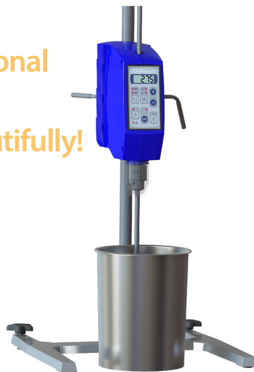
Cosmetic lotion emulsions